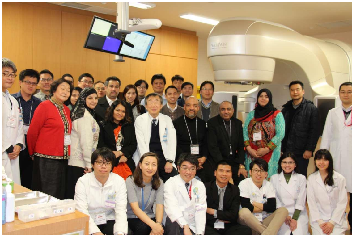
Hiroshima University Hospital