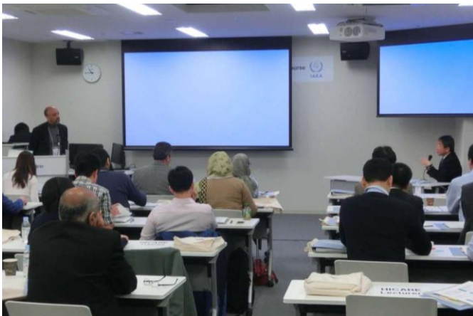
Training at HIPRAC