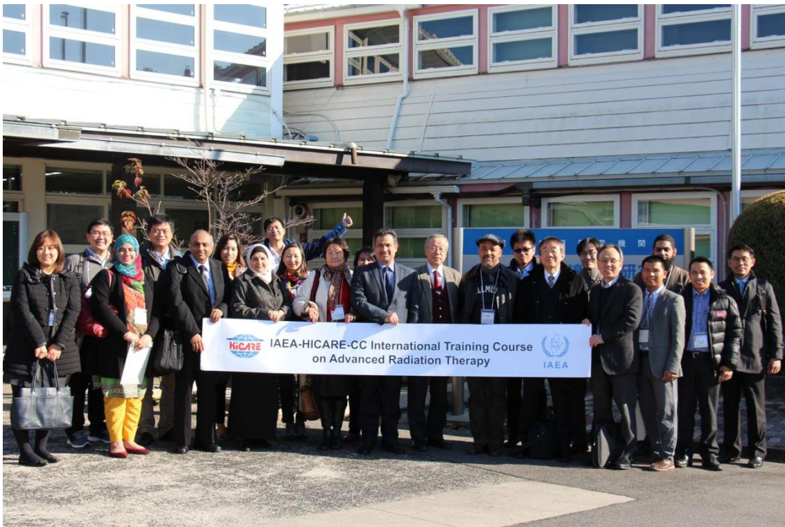
Radiation Effects Research Foundation