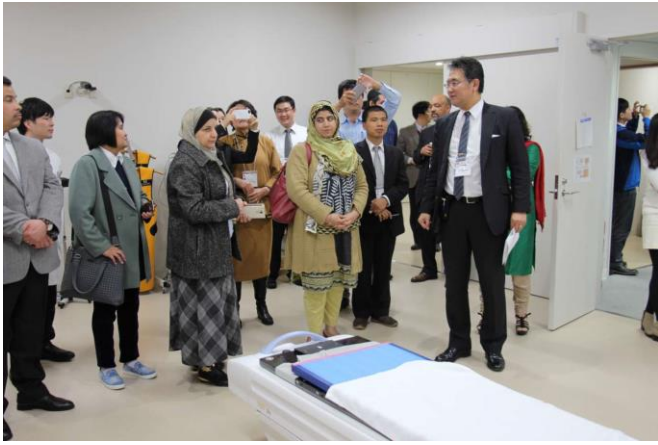
Inspection of Hiroshima High-Precision Radiotherapy Cancer Center (HIPRAC)