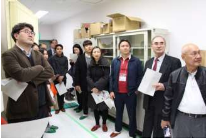
Tour at Hiroshima University Hospital