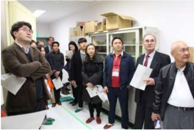
Hiroshima University Hospital Facility Tour