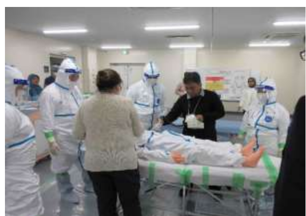
Staff members of Hiroshima University who prepared the practical training